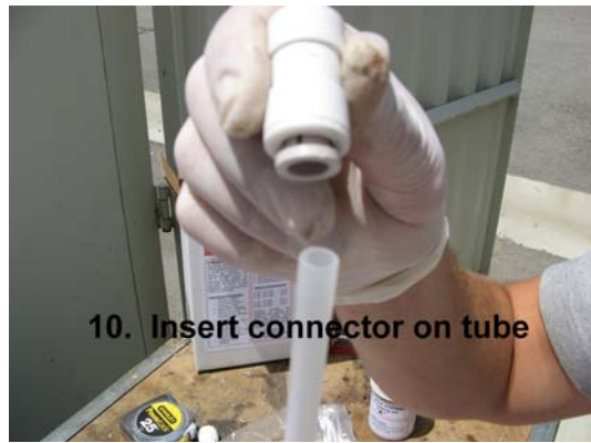
10. Insert connector on tube