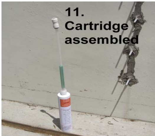
11. Cartridge assembled