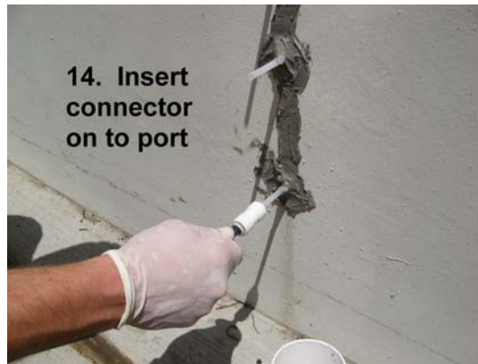
14. Insert connector on to port