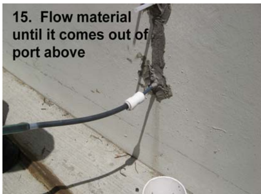
15. Flow material until it comes out of port above