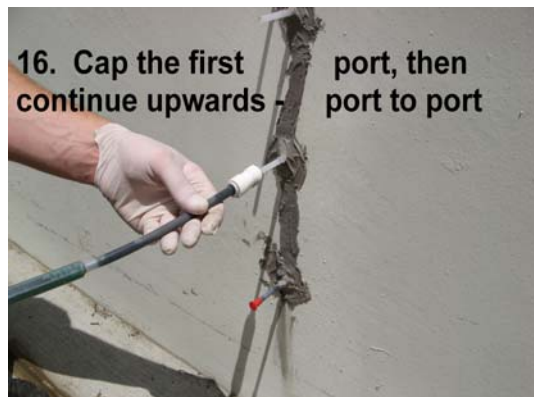
16. Cap the first port, then continue upwards - port to port